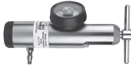
CGA 870 Yoke with Hose Barb